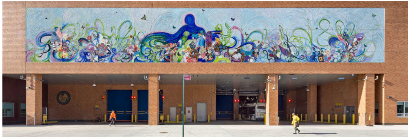
STV provided architectural and engineering services for New York City Transit's Mother Clara Hale Bus Depot. The LEED Gold-certified facility features low-emission boilers, heat-recovery air handling units, natural lighting, rainwater recycling, solar air pre-heating, and a green roof.

STV teams are critically evaluating our project workflow to embed embodied carbon reduction within our design DNA. Our approach for integrating reduction strategies includes the following steps.